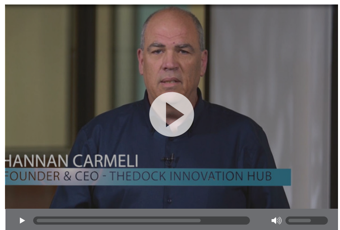
Promo video - about theDOCK Innovation Hub